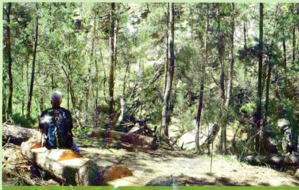
Benches provide a resting place, perfect for a picnic!