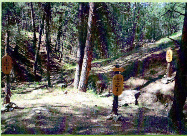
The Junction of 2-mile & 4-mile loops.